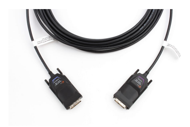
User Manual DVFC-100